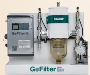
GOF 800 turbine 2µm filter