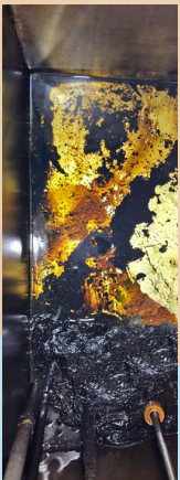
Contaminated fuel tank